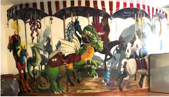
Party Mural by Courtney Christopher

Have you seen the beautiful mural on the wall of the party room? The new mural, painted by Courtney Christopher has really elevated our party place.